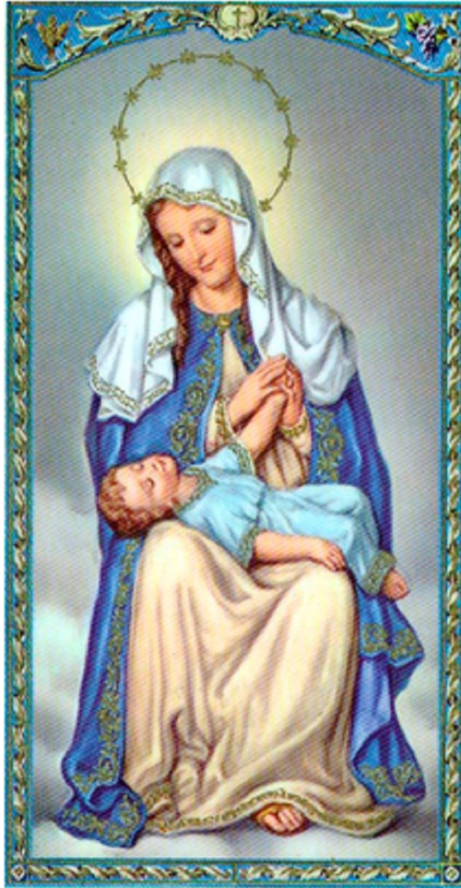
Mother of Divine Providence