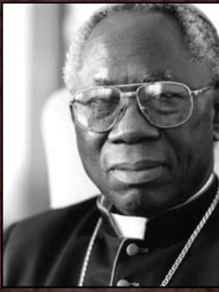
from the Vatican Francis Cardinal Arinze

Prefect emeritus of the Congregation of Divine Worship and the Discipline of the Sacraments